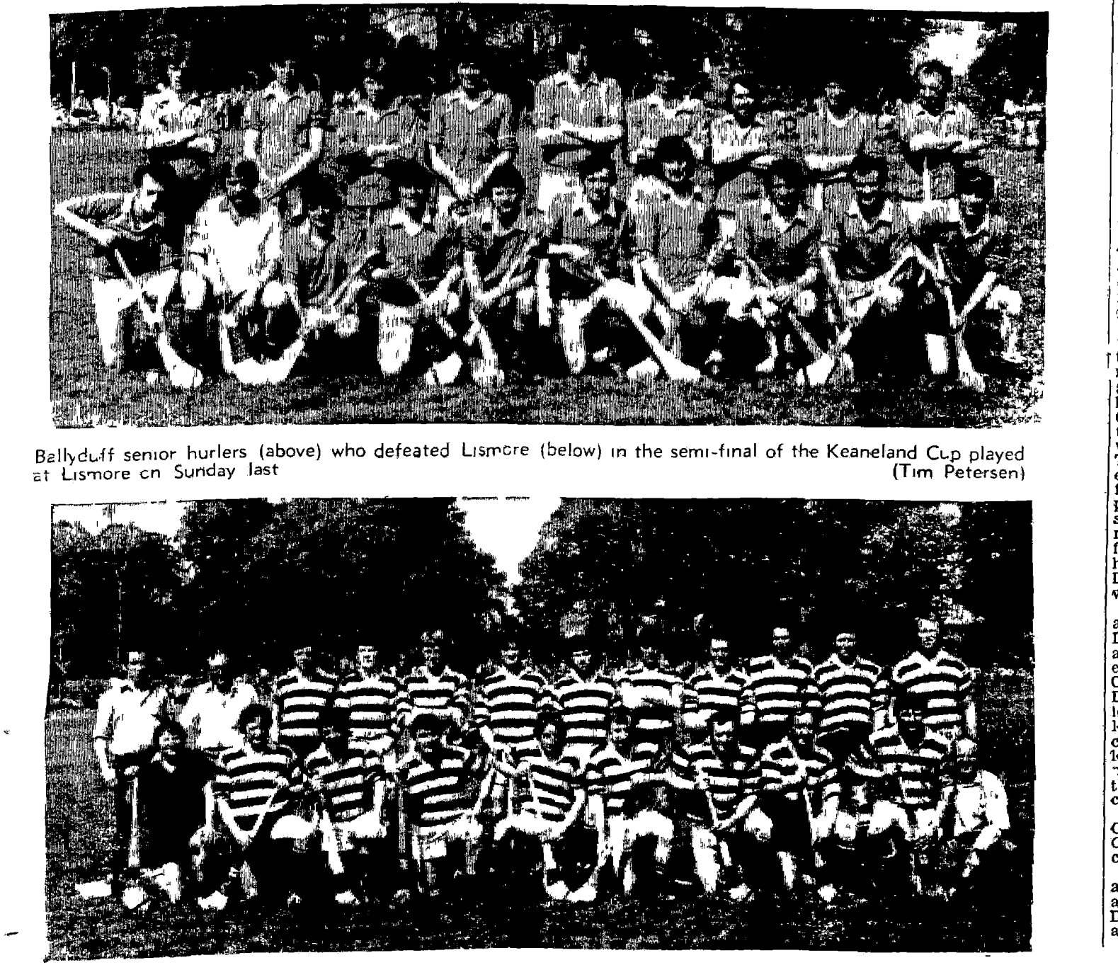
Ballyduff senior hurlers (above) who defeated Lismore (below) in the semi-final of the Keaneland Cup played at Lismore on Sunday last.