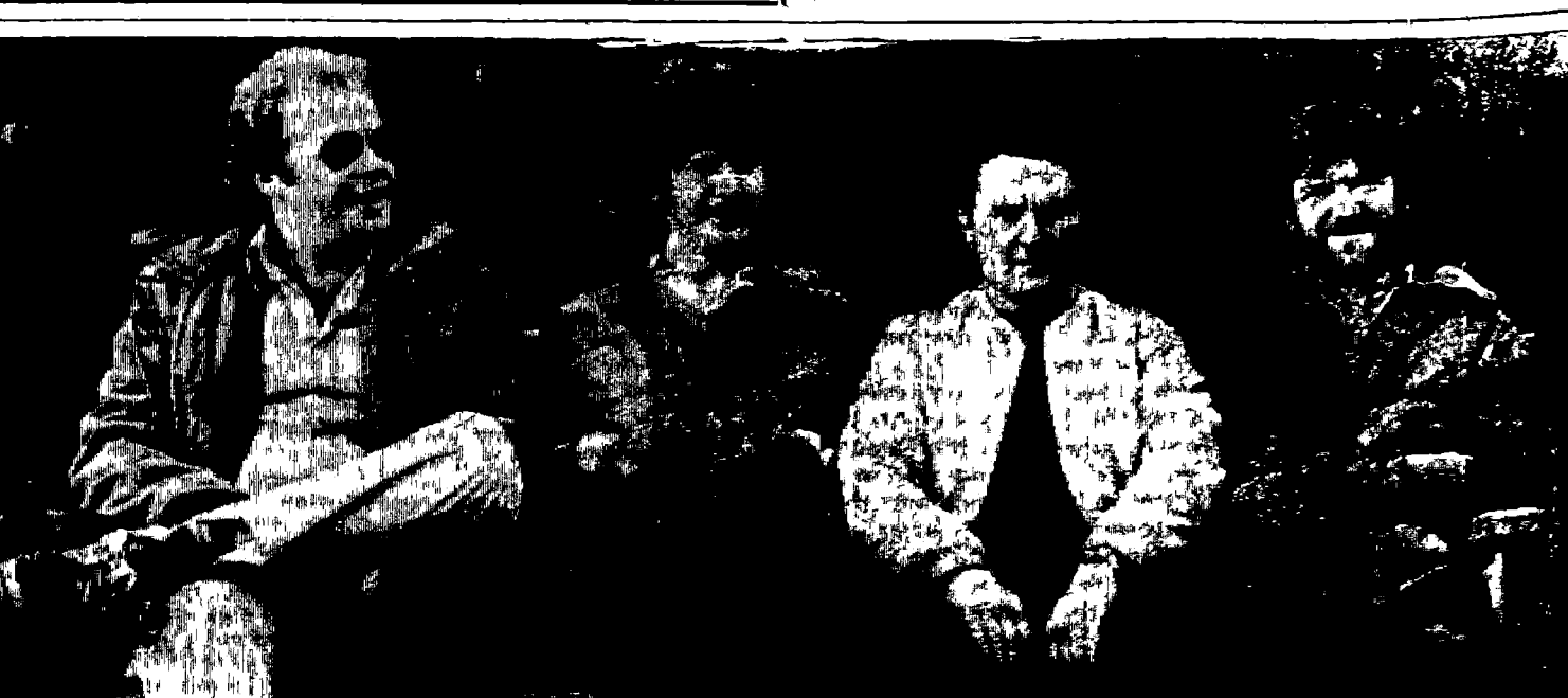
"EAGATLE" — PLAYING AT MINNIES LOUNGE BARS ABBEYSIDE ON FRIDAY, MAY 23

1st ANNUAL GENERAL MEETING IN THE COMMUNITY HALL at 9 p.m. ON THIS FRIDAY, MAY 23rd