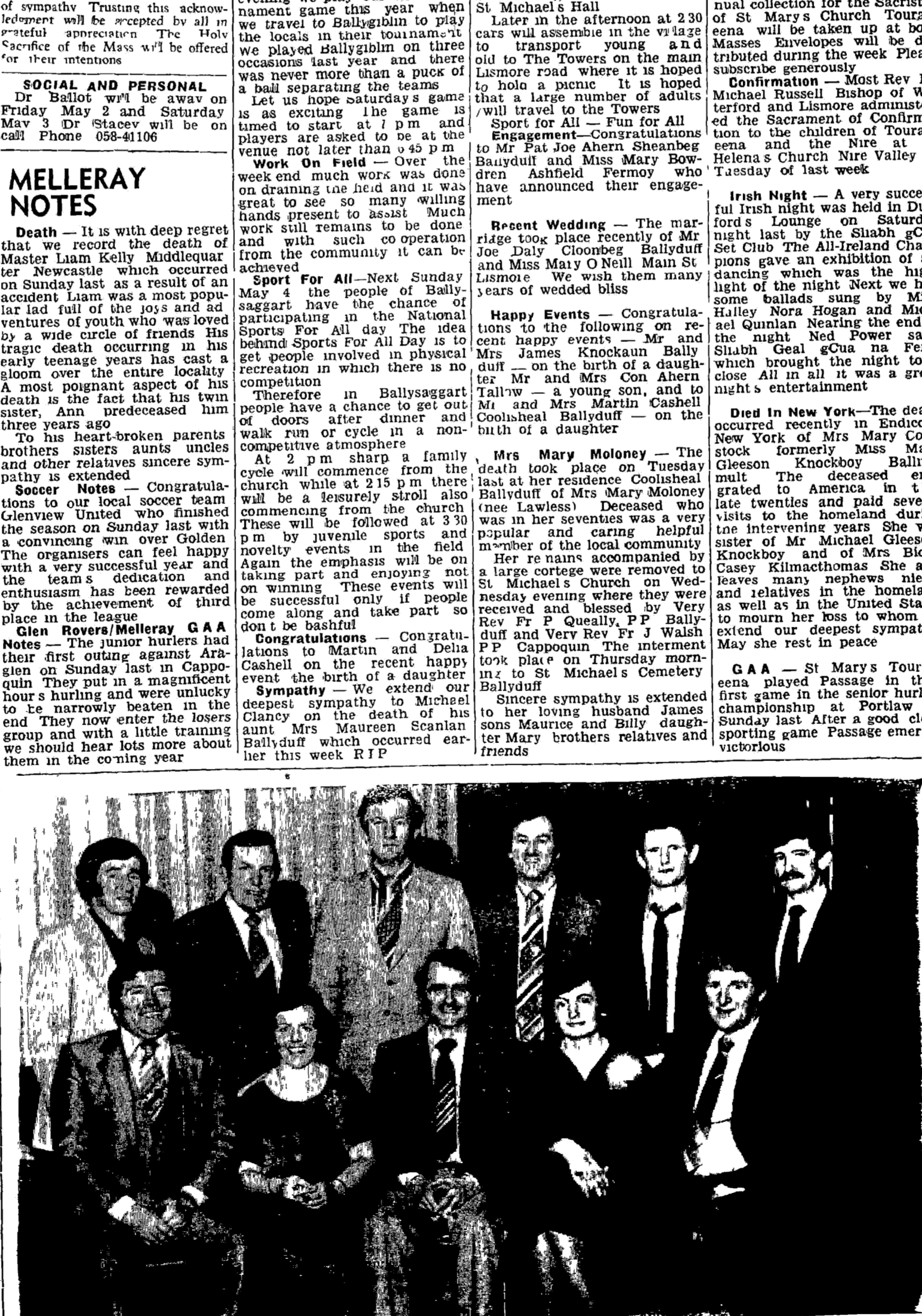
THE OFFICERS AND COMMITTEE OF MINNIES SQUASH CLUB PICTURED AT THEIR ANNUAL DINNER