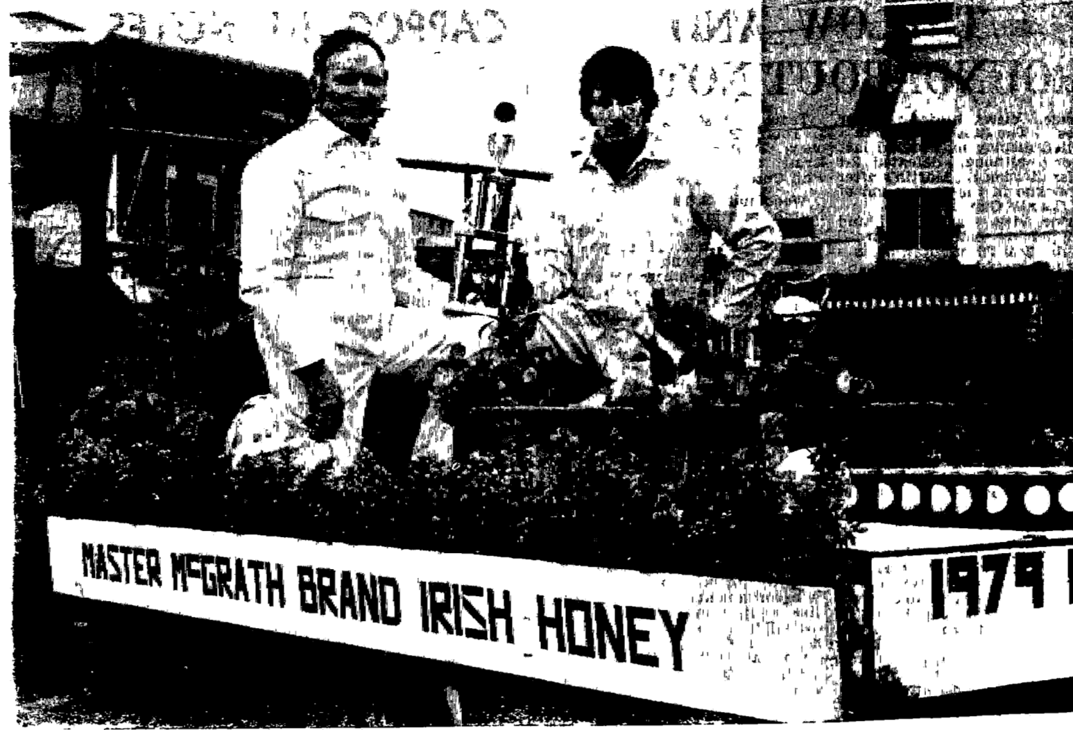
MOYNIHAN APIARIES, Dungarvan, who won the "Best Overall" award in the St Patrick's Day parade