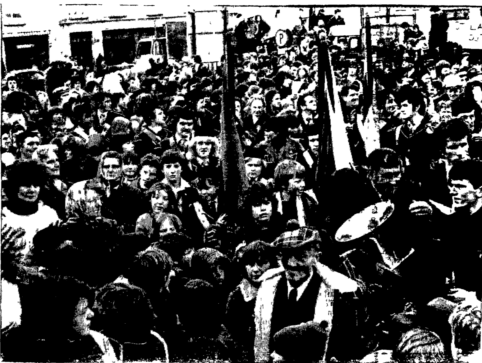
Section of the huge crowd at Grattan Square Dungarvan for the St. Patrick's Day Industrial Parade which drew a record number of onlookers and participants

THE LASS WITH THE DELICATE AIR One of the simplest and most beautiful of our Irish melodies is the setting for one of the loveliest of songs in the Irish repertoire. "The Lass With The Delicate Air" first made famous by the great John McCormack and now a favourite with many of our leading tenors — Young Molly who lives at the foot of the hill Whose fame every virgin with envy does fill Of beauty is blessed with so ample a share That men call her the Lass with the Delicate Air One evening last May as I traversed the grove In thoughtless retirement not dreaming of love I chanced to espy the gay nymph I declare And really she'd got a most delicate air That moment young Cupid selected a dart And pierced without pity my innocent heart! From thence how to gain the dear nymph was my care For a captive I fell to her delicate air A thousand times over repeated my suit But still the tormentor affects to be mute Then tell me ye swains who have conquer'd the fair How to win the fair lass with the delicate air