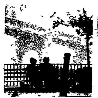
WOODY ALLENS MANHATTAN

NOW SHOWING— Friday and Saturday, 14th & 15th — 7.30 p.m. (Over 18)