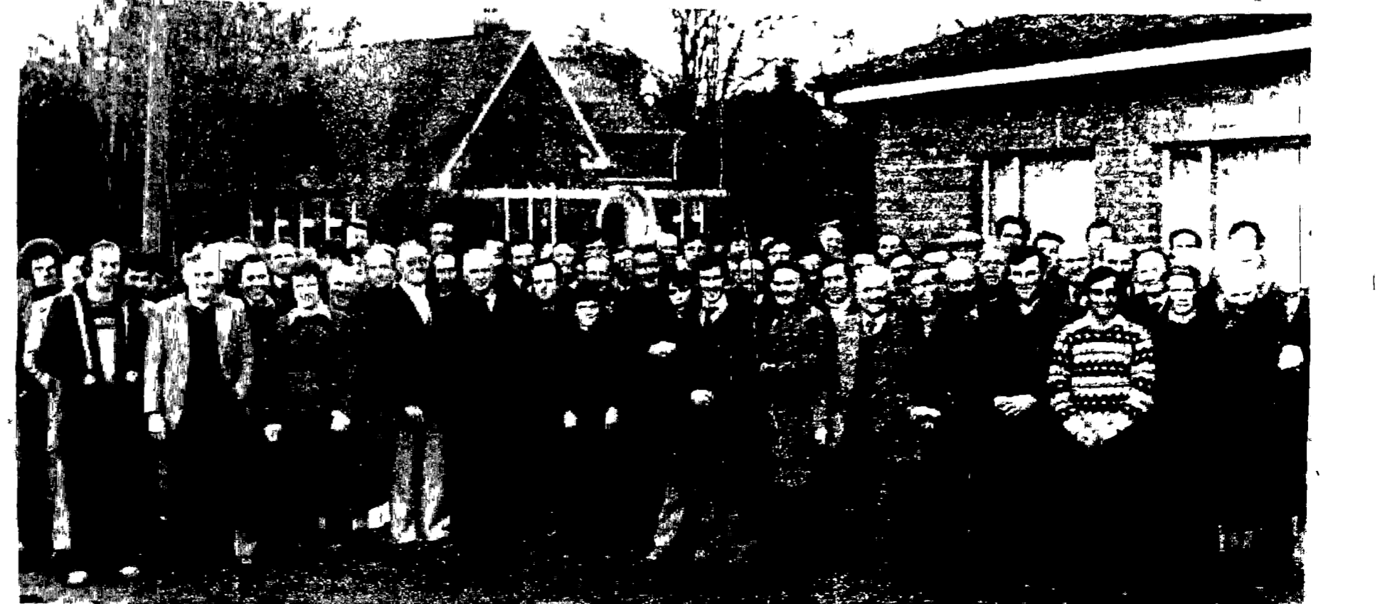
Pictured below are a group of farmers who attended a symposium on dairying held at the Agricultural Education Centre, Lismore, on Wednesday, Jan 16.