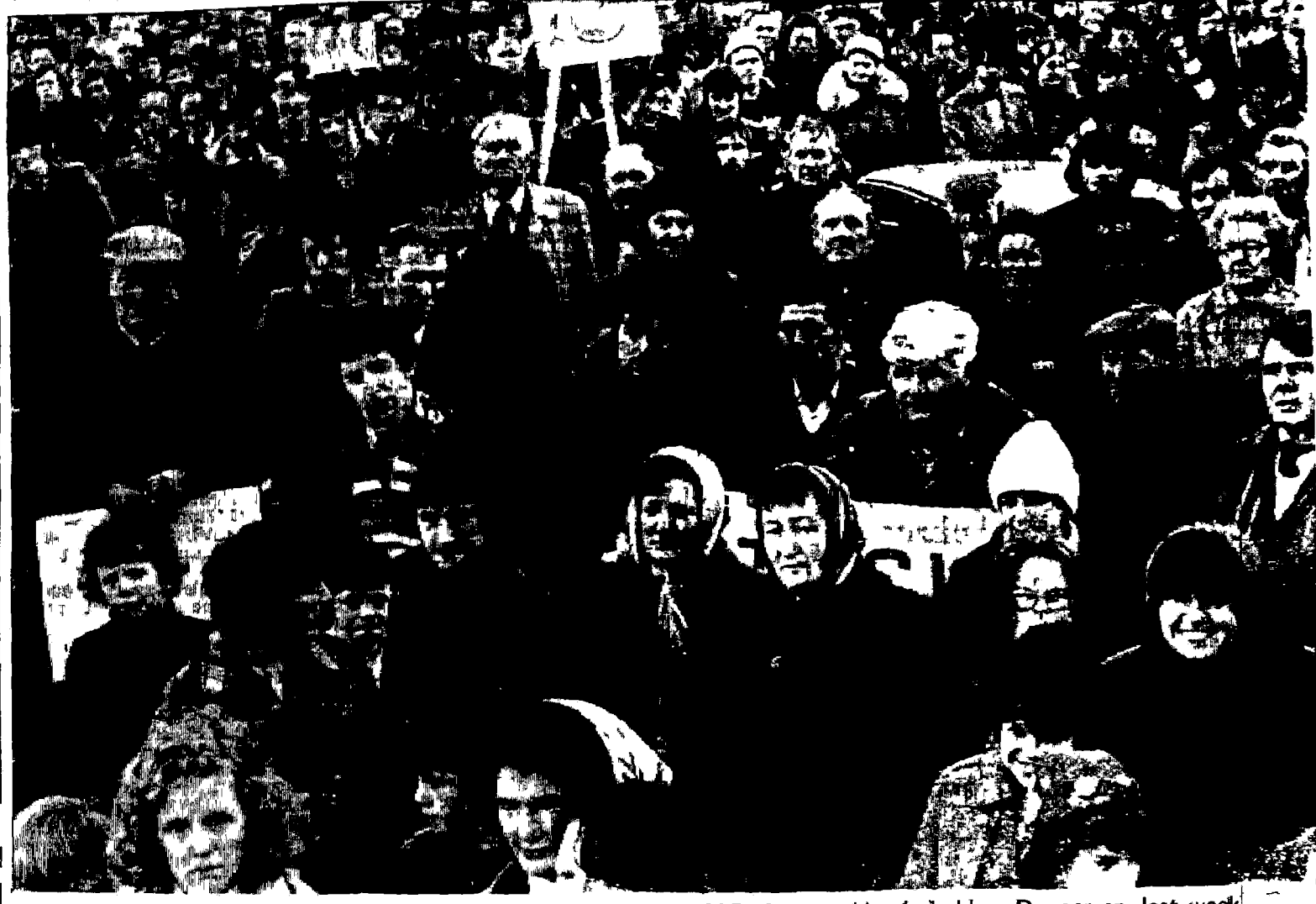
A section of the large crowd who participated in the PAYE Protest March held in Dungarvan last week