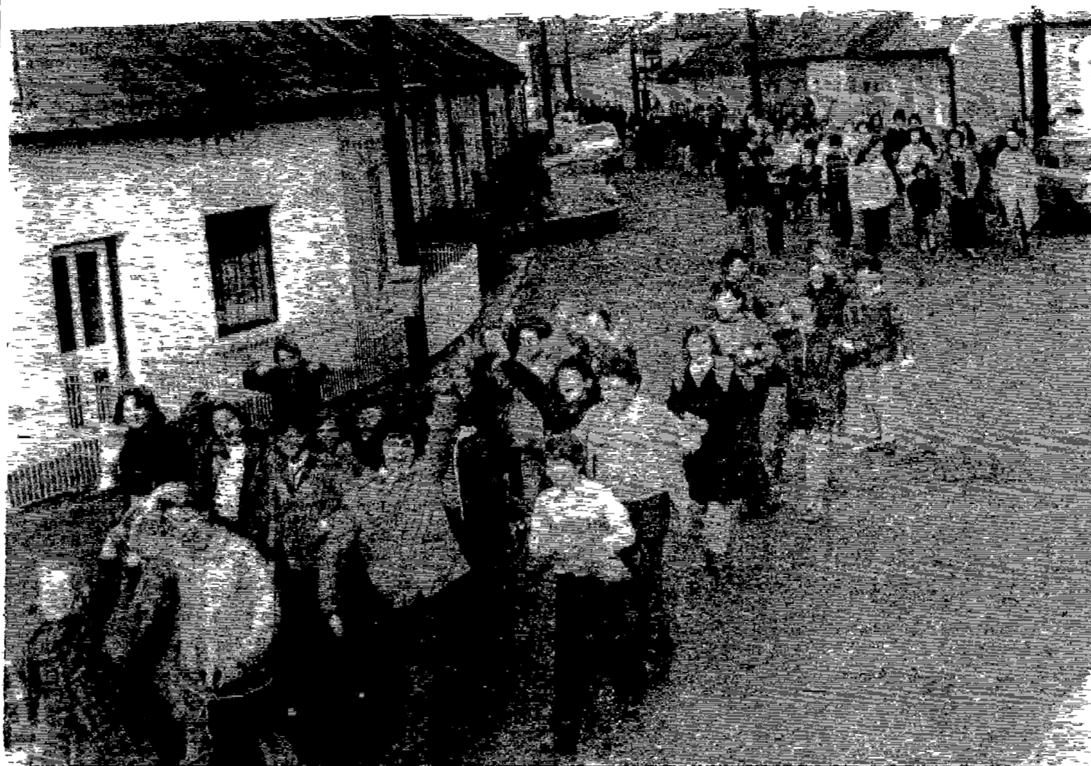
Happy Walkers — A section of the walkers who participated in the National Walk Day in Tallow recently.

LISMORE DISTRICT EXECUTIVE FINE GAEL ANNUAL SOCIAL KEANELAND HOTEL FRIDAY, NOV. 23 at 8.30 pm Music by SOCIETY FOUR Subscription — £5.00