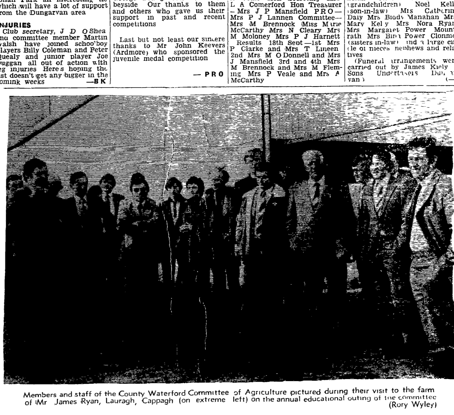
Members and staff of the County Waterford Committee of Agriculture pictured during their visit to the farm last Sunday morning as part of the annual educational outing of the committee