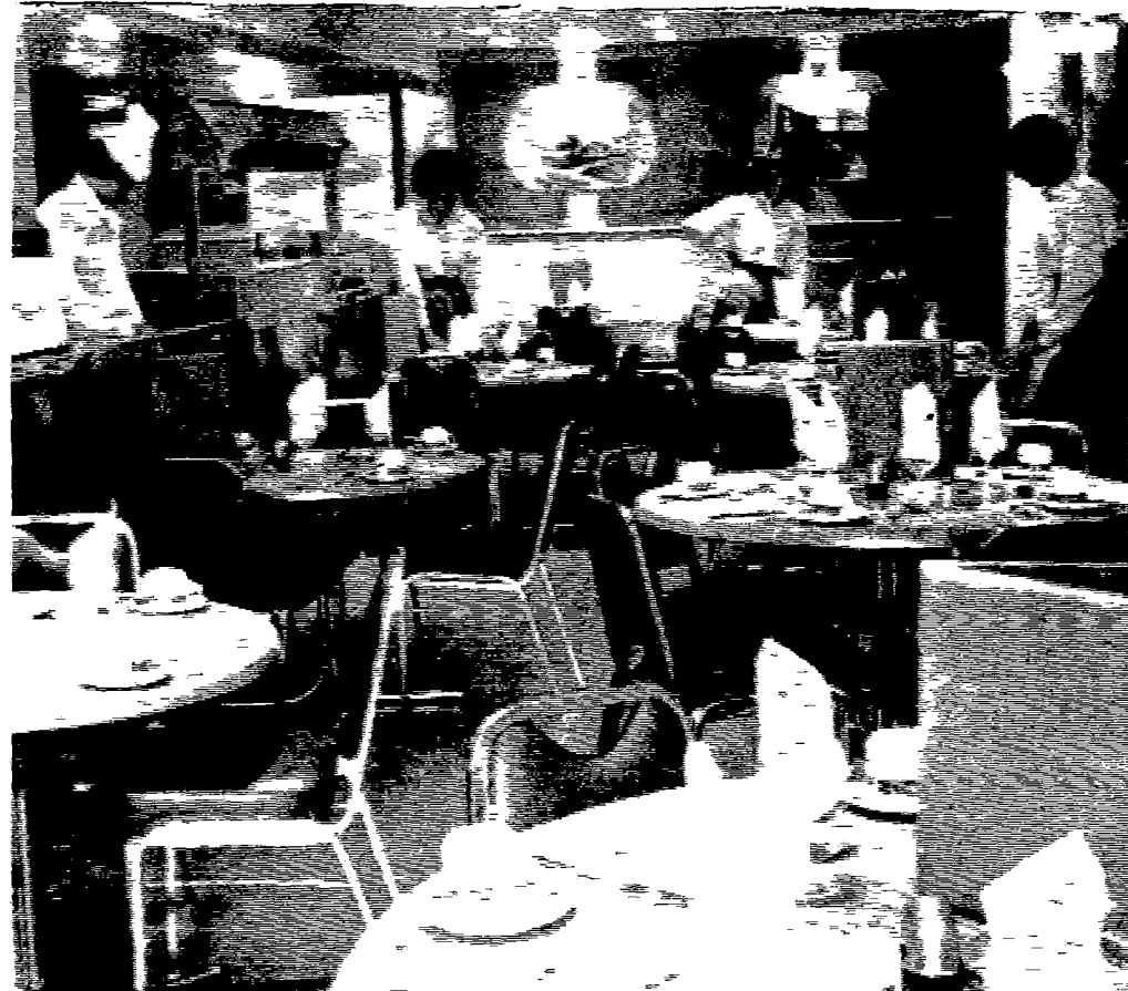
An interior view of the restaurant

CONGRATULATIONS TO BRENNAN'S OF WATERFORD AND BEST WISHES FOR THE FUTURE AT DINNY'S RESTAURANT from BYRNE BUTCHERS