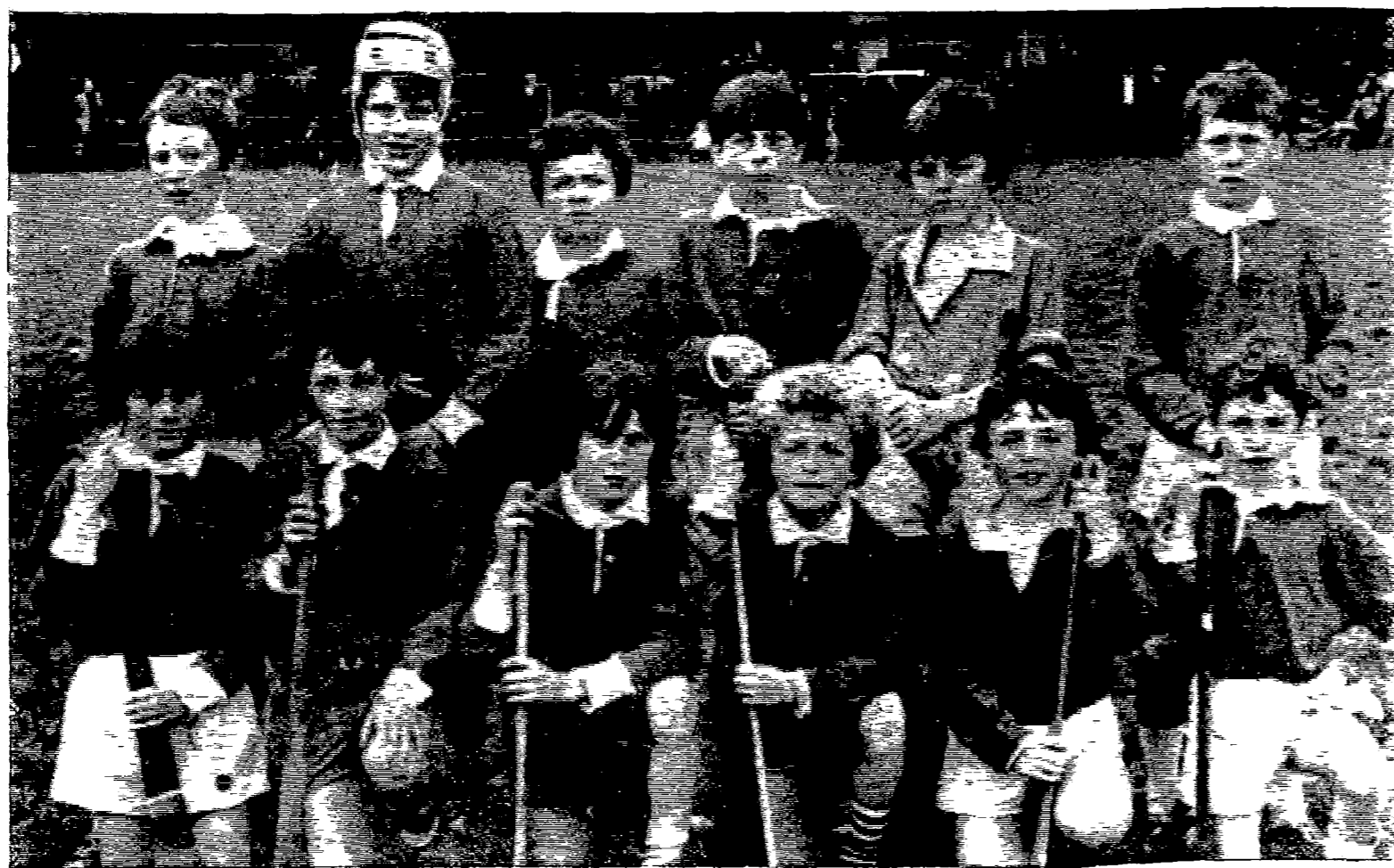
The Villas (above) who beat Youghal Road (below) in the 3rd/4th class final in the Dungarvan CBS Street Leagues