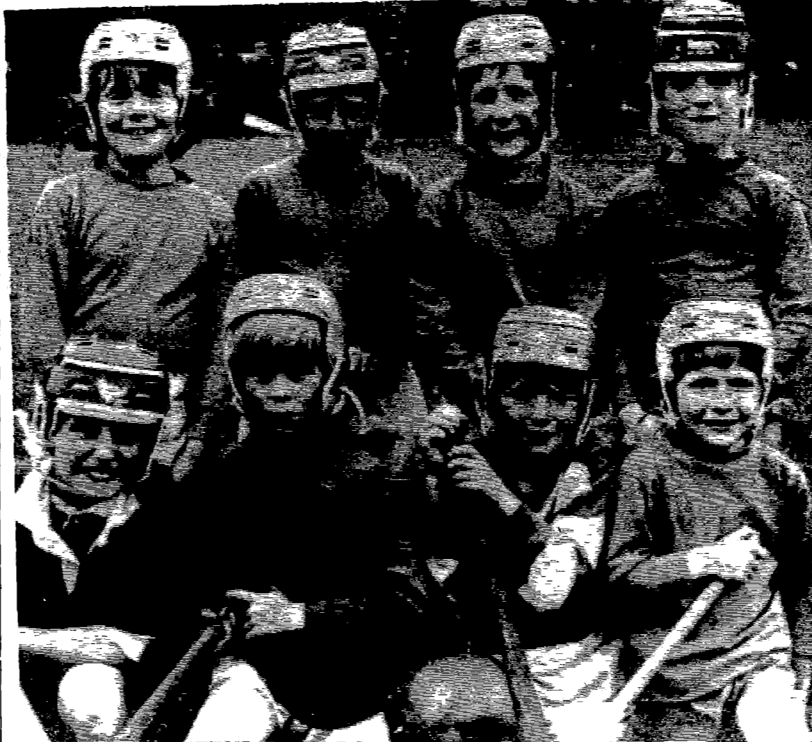
The Mitchells (above) who beat The Villas (below) in the 2nd Class final in the Dun- garvan CBS Street Leagues

EMMETTS v MELLERAY This will be the second game at Cappoquin on Sunday afternoon and based on that form they won't beat Lismore