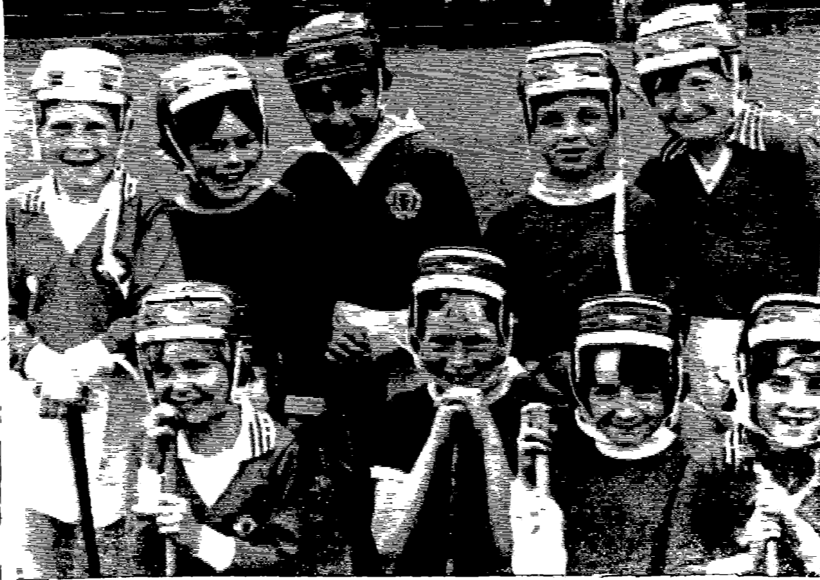
The Mitchells (above) who beat The Villas (below) in the 2nd Class final in the Dun- garvan CBS Street Leagues

THE BALLYVERA BALLYDUFF TO WIN Unless Ballyduff show a complete turn of form they must beat St Mollerans in the open- ing game here on Sunday