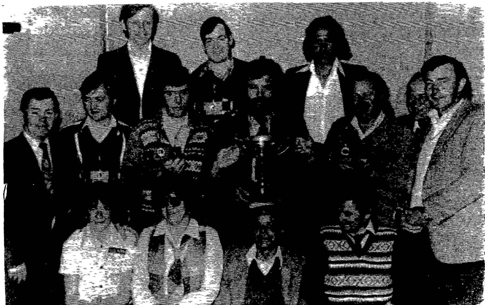
The High Chap Darts team—winners of the Dungarvan District "B" Darts League recently