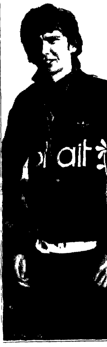
OUR CHAMPION SUPREME

John Treacy, the frail looking young man from Villierstown who surprised everyone with a magnificent victory when he won the World Cross Country title at Bellahouston Glasgow last year has again become the toast not only of his native Villierstown and County Waterford but of all Ireland and indeed wherever cross country running is discussed.