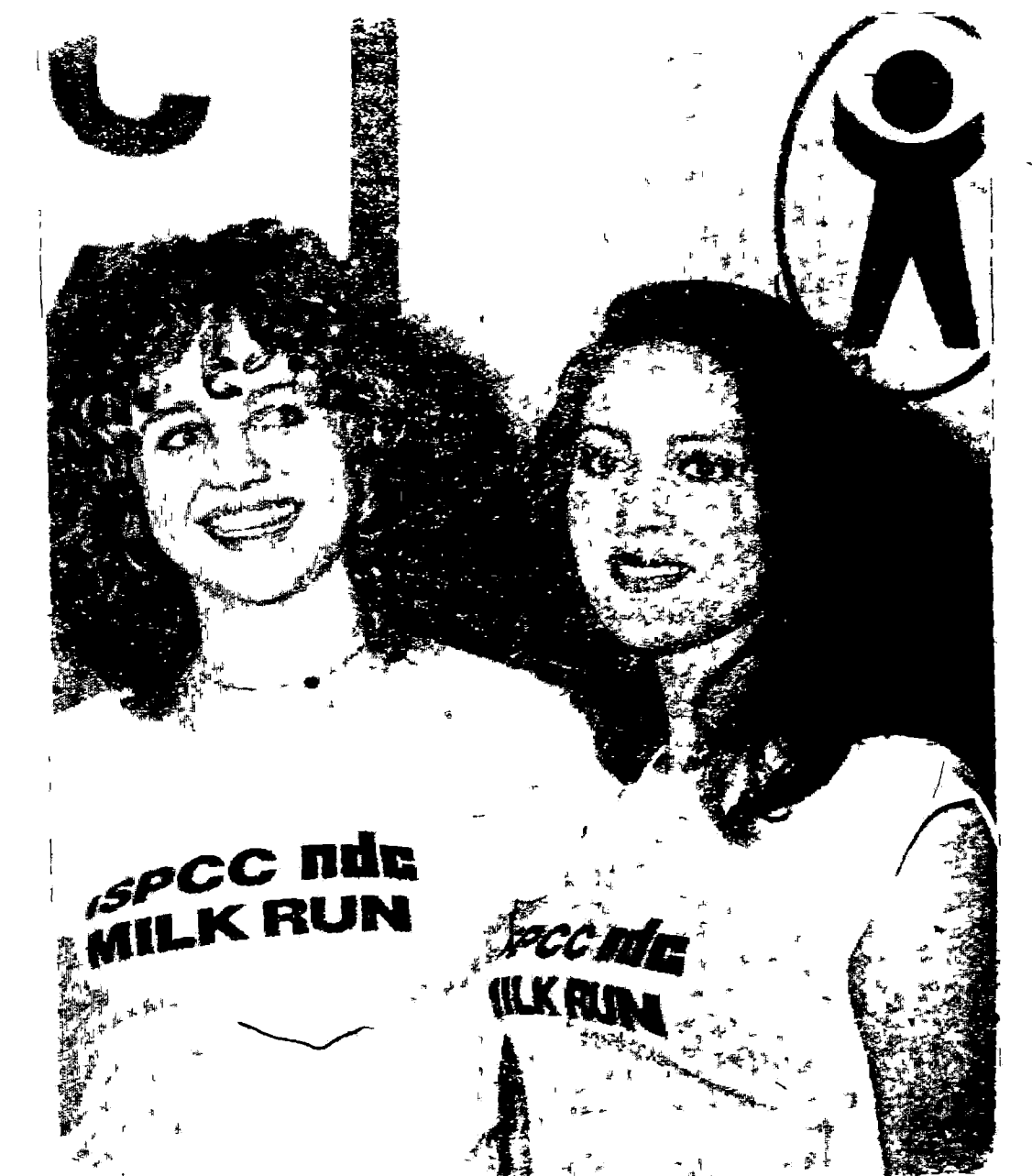
Two of Ireland's top models who will be taking part in the ISPCCC National Milk Run on Sunday April 1st