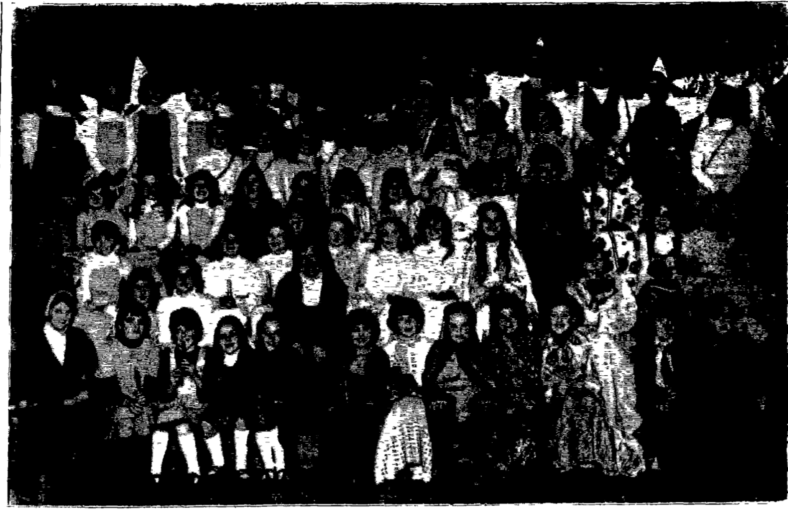
The cast of the play presented by the pupils of the Mercy Convent School, Dungarvan in the School Hall