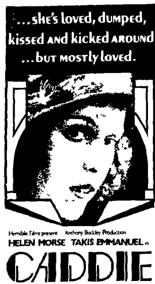
...she's loved, dumped, kissed and kicked around...but mostly loved. HELEN MORSE TAKES OVER THE ROLLS OF CIDDIE

Sunday to Thursday 8 p.m. Friday and Saturday 7.30 p.m. SPECIAL MATINEES ON SUN 31st, MON. JAN 1st and SAT JAN 6th — at 3 p.m.