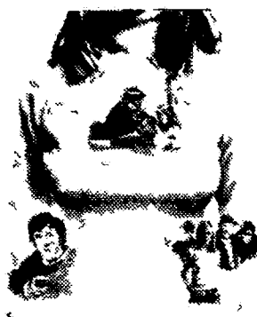
DUSTIN HOFFMAN "STRAW DOGS" SUSAN GEORGE

Simon Ward ALL CREATURES GREAT AND SMALL Also — SHORTS