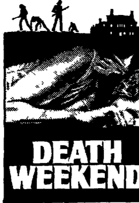
DEATH WEEKEND Also CIRCUS OF FEAR

It began with a rape. It ended with a massacre!