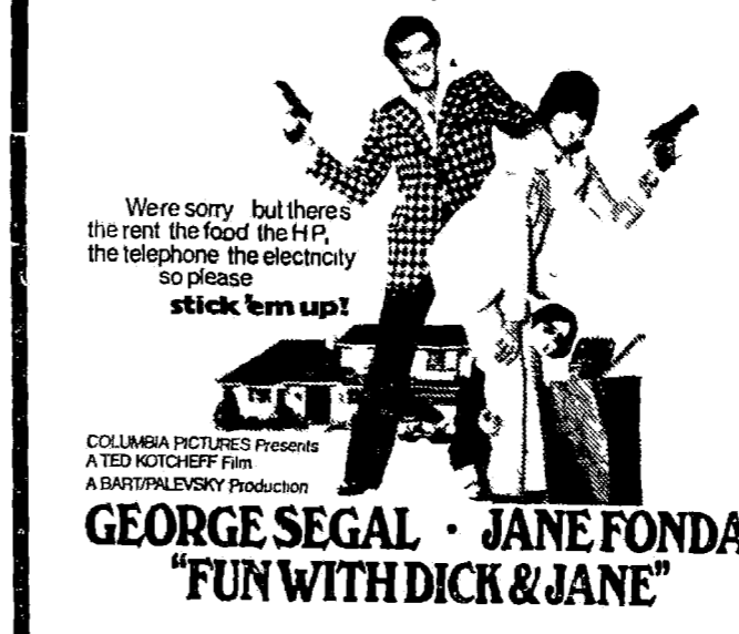
Also - THE SWISS CONSPIRACY

Friday and Saturday, May 19th and 20th. 7.30 p.m. (Under 12s accompanied) BONNIE AND CLYDE THEY AIN'T