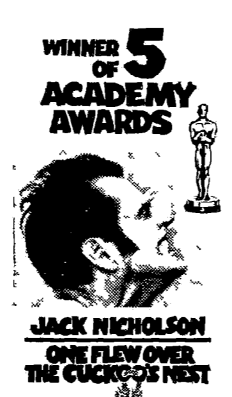
JACK NICHOLSON ONE FLEW OVER THE CUCKOO'S NEST

Monday and Tuesday, 15th and 16th May 8 p.m. Over 18