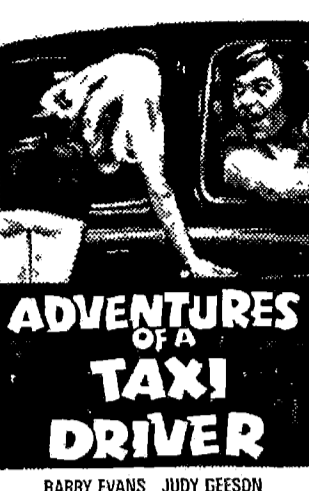
Also DADDY DARLING

LATE SHOW— Friday and Saturday, May 5th and 6th 11 p.m. Over 18