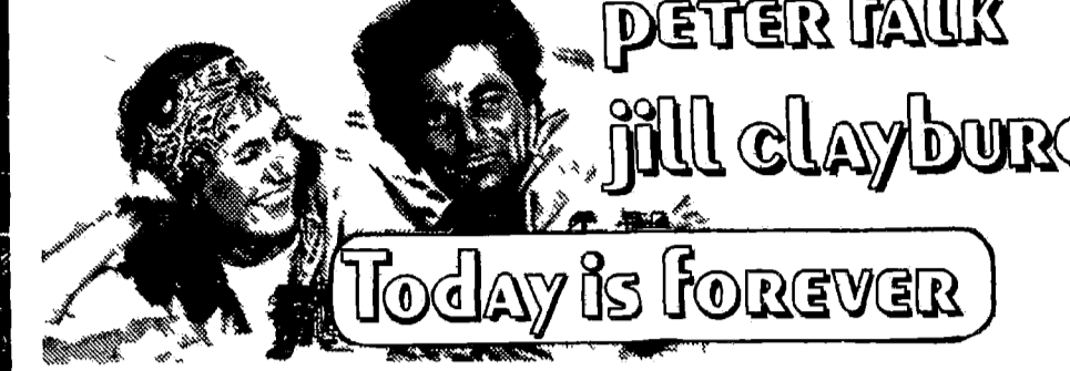
Also — NO GOLD FOR A DEAD DIVER

It will make you laugh... It will make you cry... And you will remember it FOREVER!