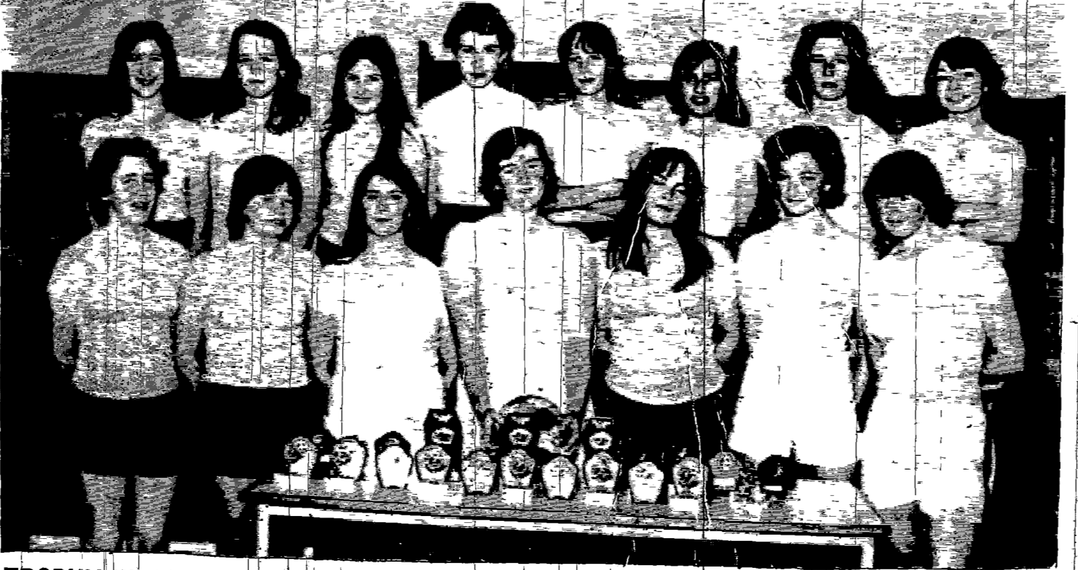
TROPHY WINNERS — Pictured above with their trophies are members of the Lismore Ladies Soccer team who this year won, among other things, the County final of Community Games Soccer Competition