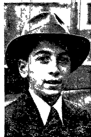
SCOT BAIO FLORRIE DUGGER

MONDAY, AUGUST 1st — 5 DAYS MONDAY TO THURSDAY 8 P.M. FRIDAY 7.30 P.M.