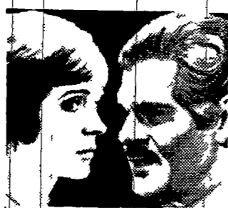
A BLAKE EDWARDS FILM Julie Andrews Omar Sharif The Tomorrow Seed

LATE SHOW— FRIDAY & SATURDAY JULY 29th & 30th 11 p.m. Over 18