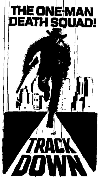
Also "Maniac At Large"

LATE SHOW Friday and Saturday, 25th & 26th February, 11 p.m. Over 18