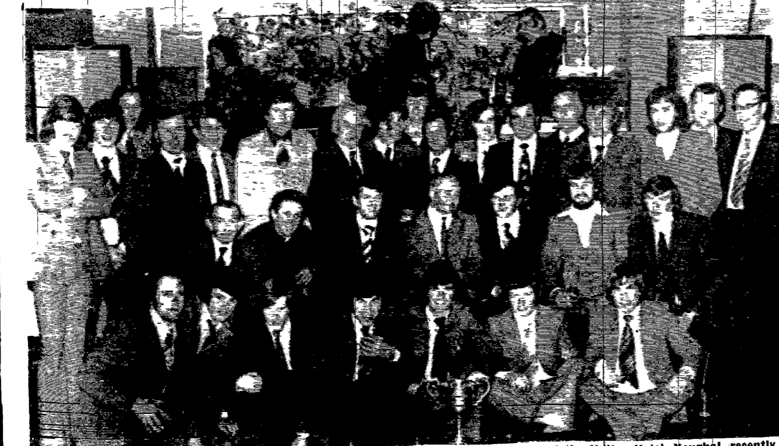
The committee and players of Ardmore G.A.A. Club pictured at their Annual Dinner at the Hilltop Hotel, Youghal, recently