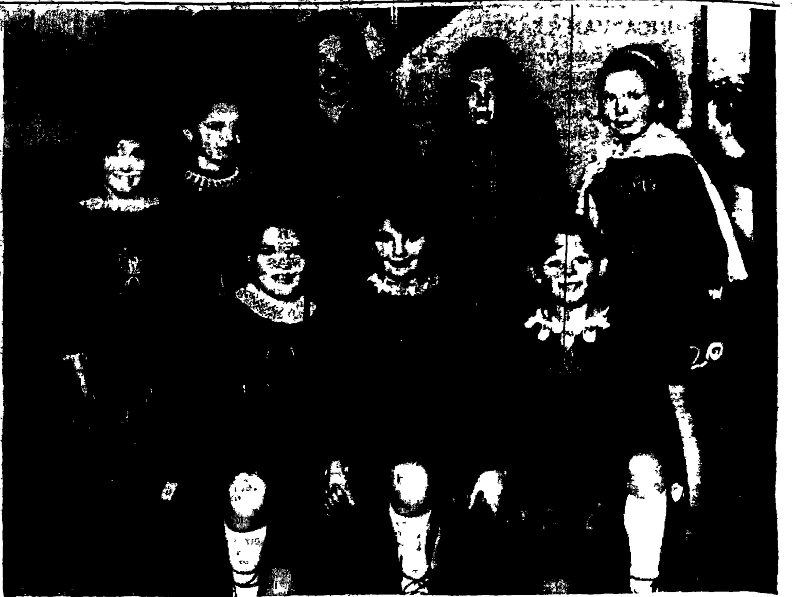
Pictured above are a group of Irish dancers who took part in a Fests held recently by the Hallahan School of Dancing in Lawlor's Hotel, Dungarvan