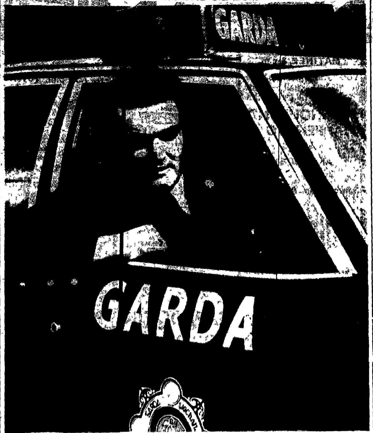
Garda Oliver Stapleton—a native of Lismore and Limerick's new singing star