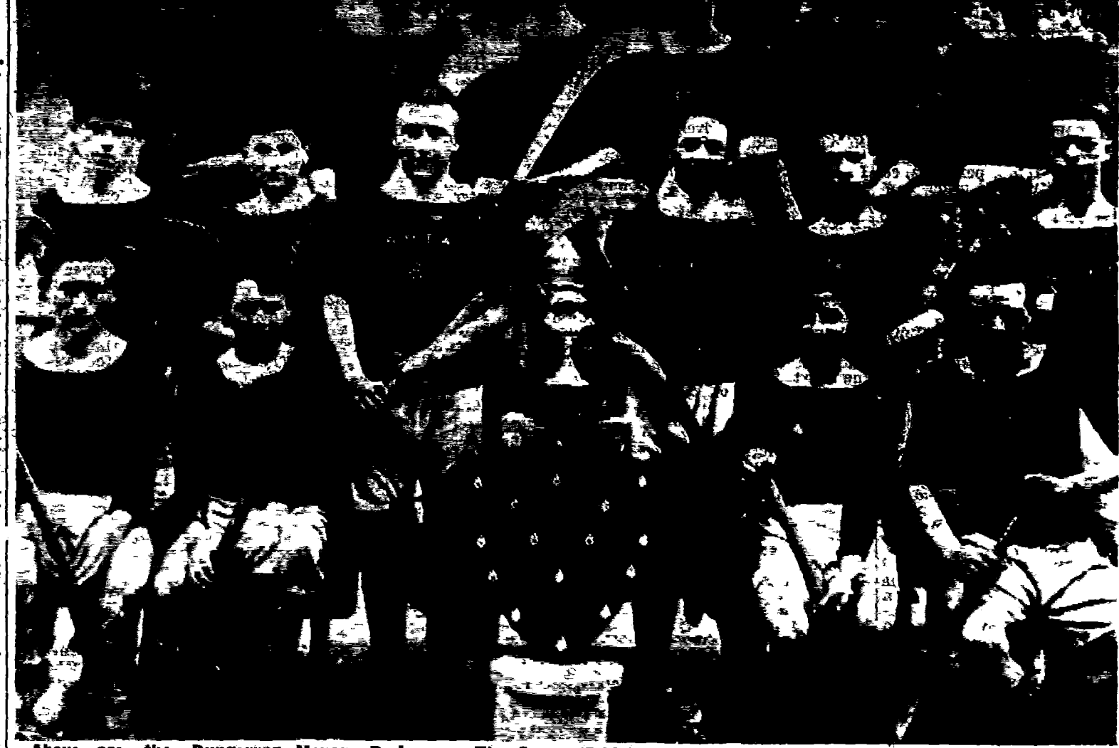
Above are the Dungarvan G.B.S. 1928 Dr. Hackett Cup team photographed with the cup and medals after they had defeated Mount Sion in the final.