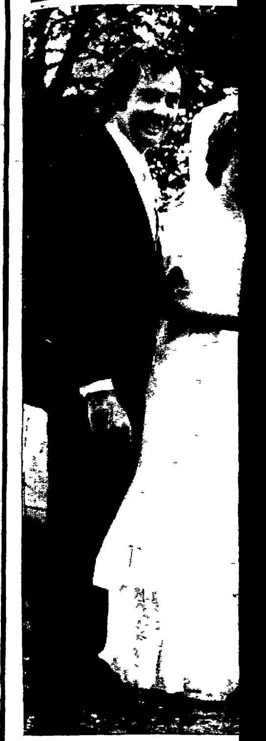
MR TOM BRODERICK, MAPS TO MISS BRIGID POWER, BALLINACORNEY WHO WERE MARRIED IN BALLINACORNEY (Photo)

At a meeting of the County Board Fixtures Committee held on Tuesday night last the following county finals were drawn: U/21/F - Not fixed. U/21/F - Not fixed.