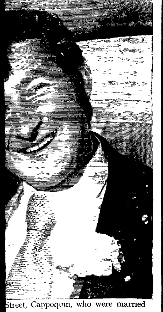
Street, Cappoquin, who were married