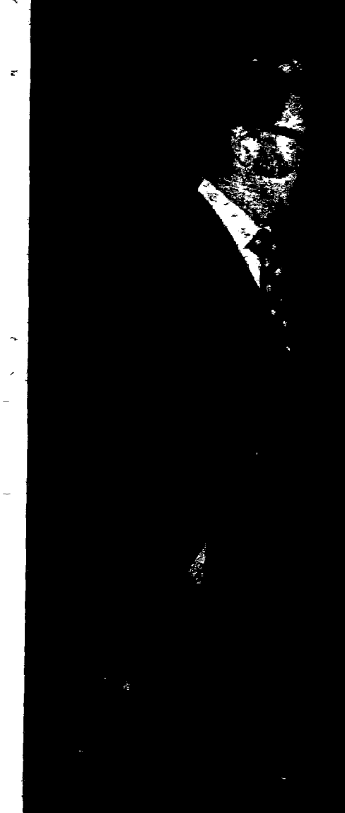
First bag of Shandon Summer Dairy Co picture includes 11 to 12 picture

CLUB ITEMS Our senior hurlers face Ballygunner in the championship semi-finals at Cappoquin on Saturday evening