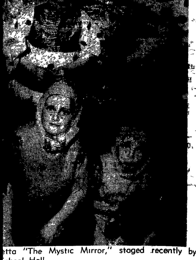
...etta "The Mystic Mirror," staged recently by school Hall