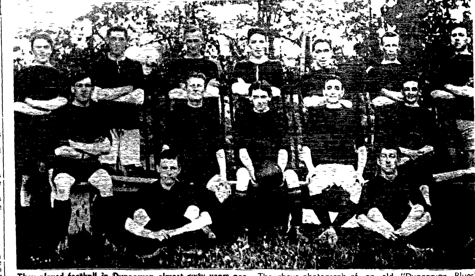
They played football in Dungarvan almost sixty years ago—The above photograph of an old "Dungarvan Blues" football team came into our possession recently. We have been informed that this team was in action in and around the year 1915 but the owner of the original photograph was unable to identify all the players of that time. Is there any reader who might be able to do so. We would be most interested to find out