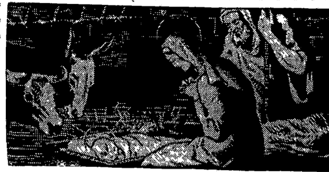
Christmas Wish of an Exile