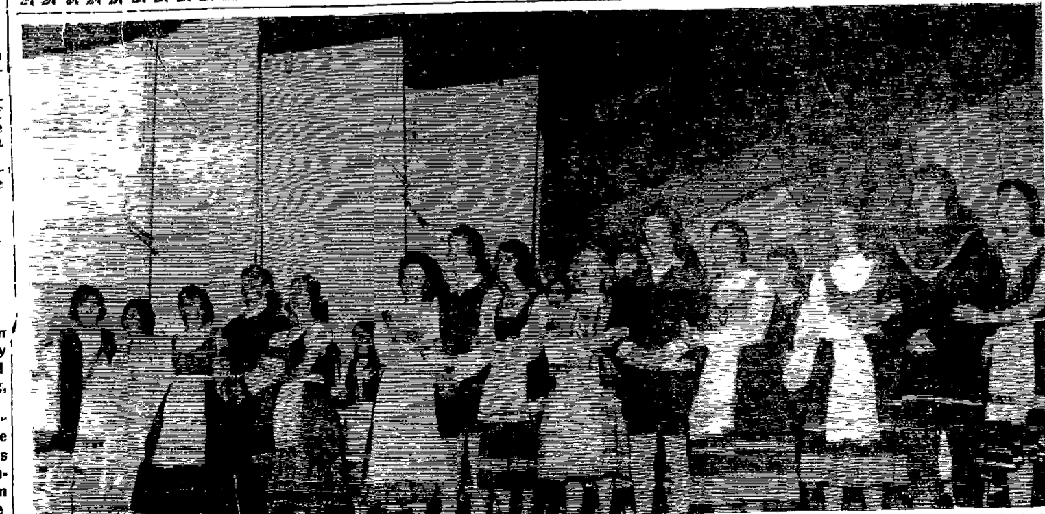
Above is a scene from Dungarvan United Soccer Club's 2nd Annual Pantomime "Ole King Cole" which concluded a record breaking week's run at the Friary Hall, Dungarvan, on Sunday night last

WE CAN NOW HANDLE ALL TYPES OF CRASH-WORK WITH A GUARANTEE OF COMPLETE SATISFACTION ALL MAKES OF CARS SERVICED AND REPAIRED IN OUR WORKSHOP MAIN AUSTIN, TRIUMPH, ROVER, LAND ROVER, PEUGEOT AND CITROEN DEALERS DUNGARVAN Phone 41811