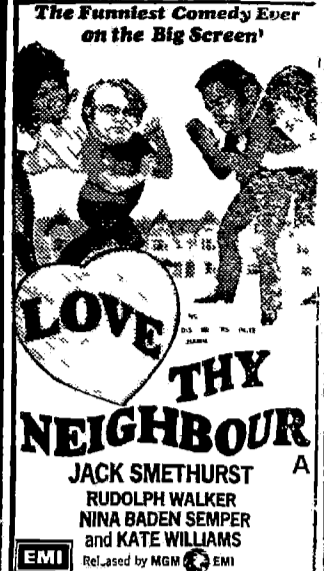
Also Patricia Neal Britt Ekland "BAXTER"