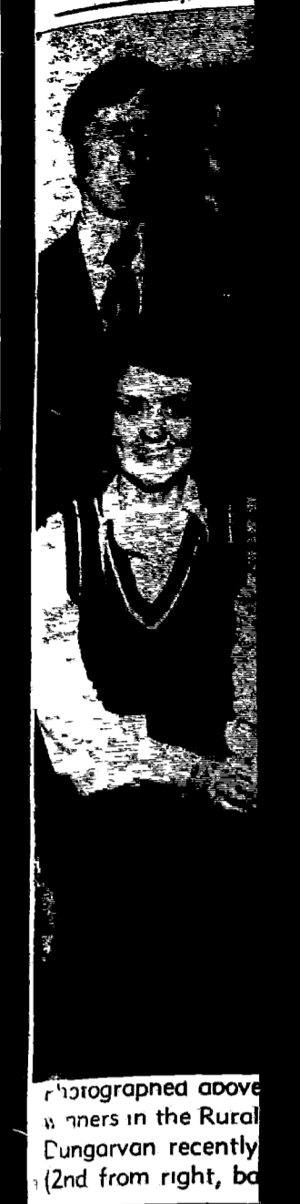
Photographed above members in the Rural Club Dungarvan recently (2nd from right, bo...)