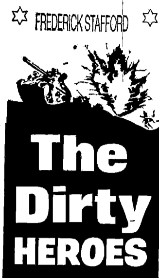
Also Christopher Lee, Peter Cushing "DRACULA"