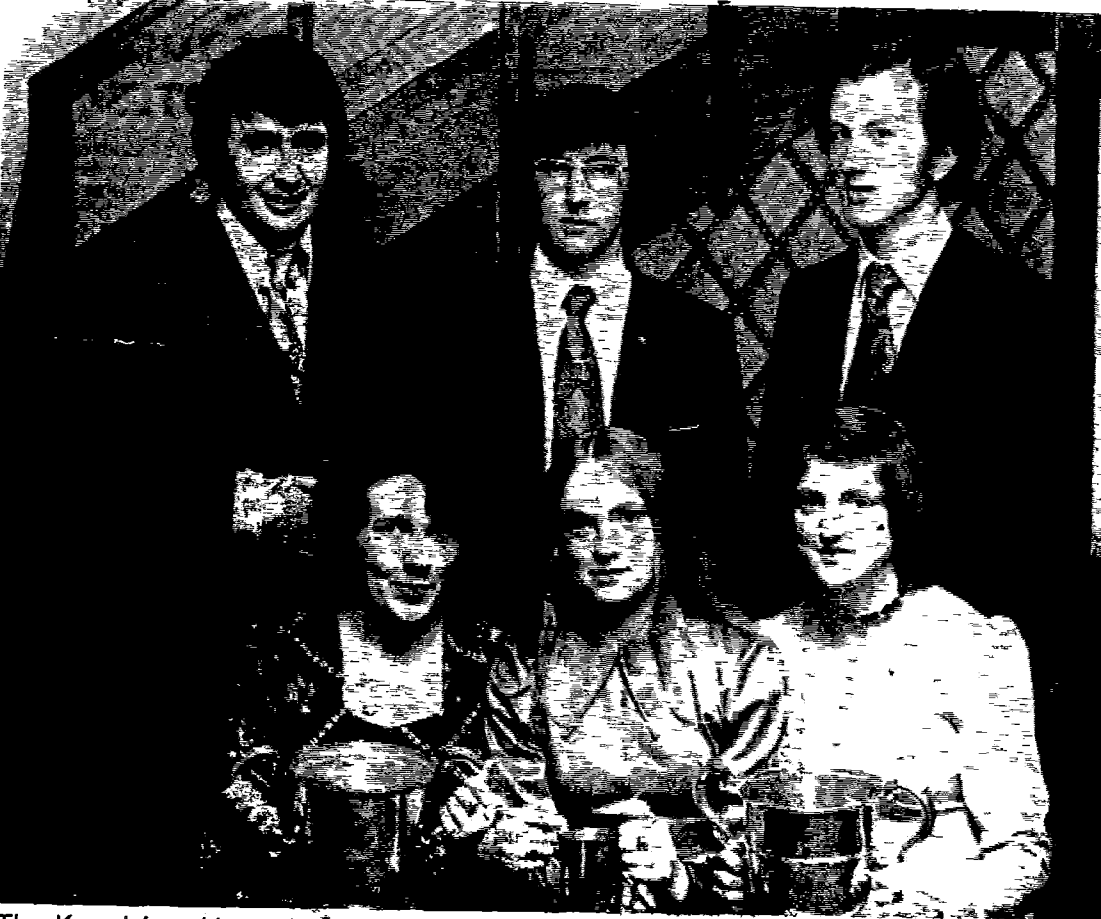
The Kinsalebeg Macra Na Feirme team photographed with the trophies which were presented to them at the 25th Annual Dinner Dance of Macra County Executive which was held in Lawlor's Hotel, Dungarvan, recently. The team were winners during the past year of the Novice Public Speaking, Debating and Panel Speaking competitions.

Finally it was agreed by 6 votes to 2 to approve of the recommendations with the addition of the change as proposed for Main Street to allow one hour, one side parking there also.