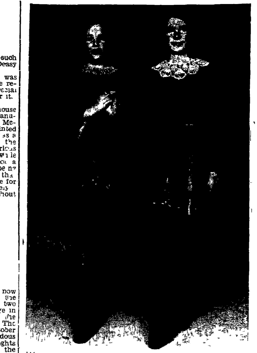
Winners in the two-hand reel at Feis Na nDeise were Caroline Keane and Siobhan Ni Faolan

Waterford can feel justly proud of their determined display on a day when luck failed to favour them.