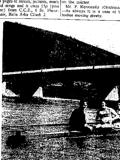
Members of the eight man crew of Dungarvan Rowing Club who recently undertook and completed the marathon 16 miles row from Youghal to Cappoquin...