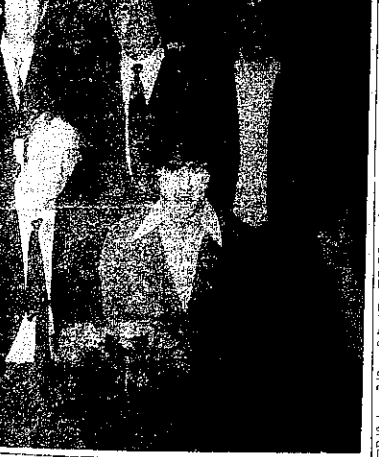
Abbeyside won their trophy over the other teams...