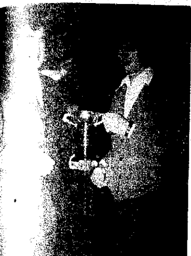
Abbeyside won their trophy over the other teams...