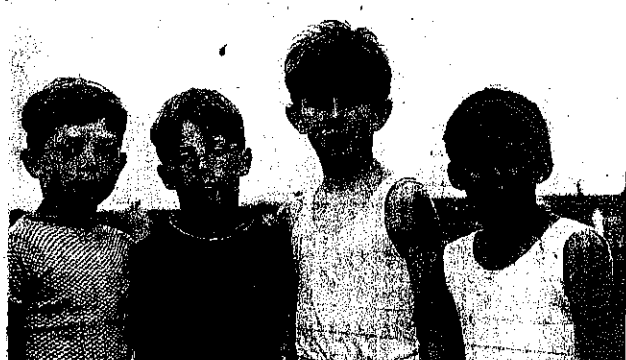
Community Games Sports Winners—Winners in the Community Games' Sports ...