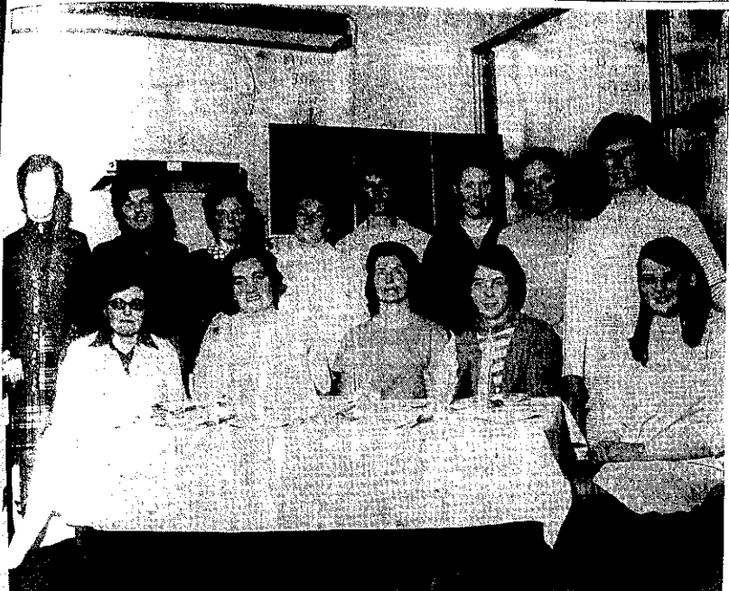
Participants who took part in the Home Management Course held under the auspices of the County Waterford ...