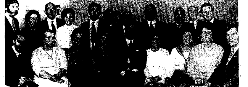
Committee members and guests photographed at the annual Social of Dungarvan Comhairle Ceantair Fianno Faid held in Lawlor's Hotel, Dungarvan, recently.