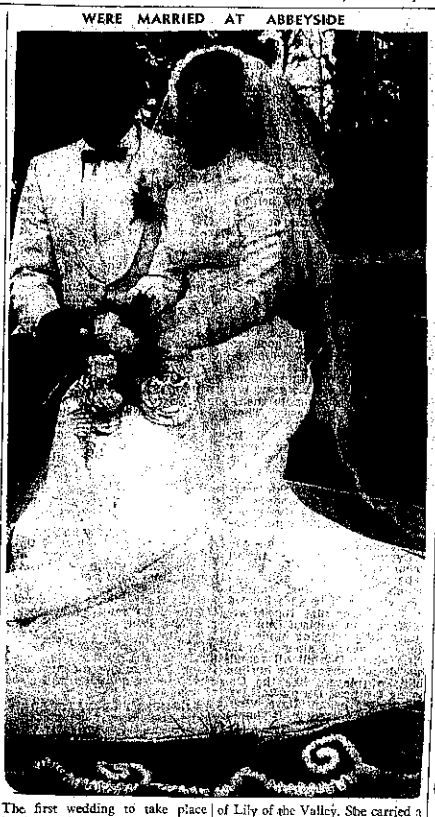
WERE MARRIED AT ABBEYSIDE