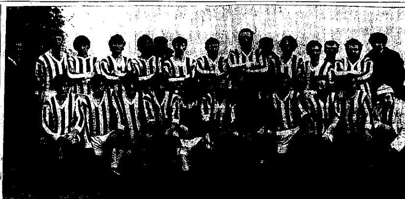
The Taurin team which won the junior football County title this year, after a lapse of almost twenty years, during which they had little success in this code.