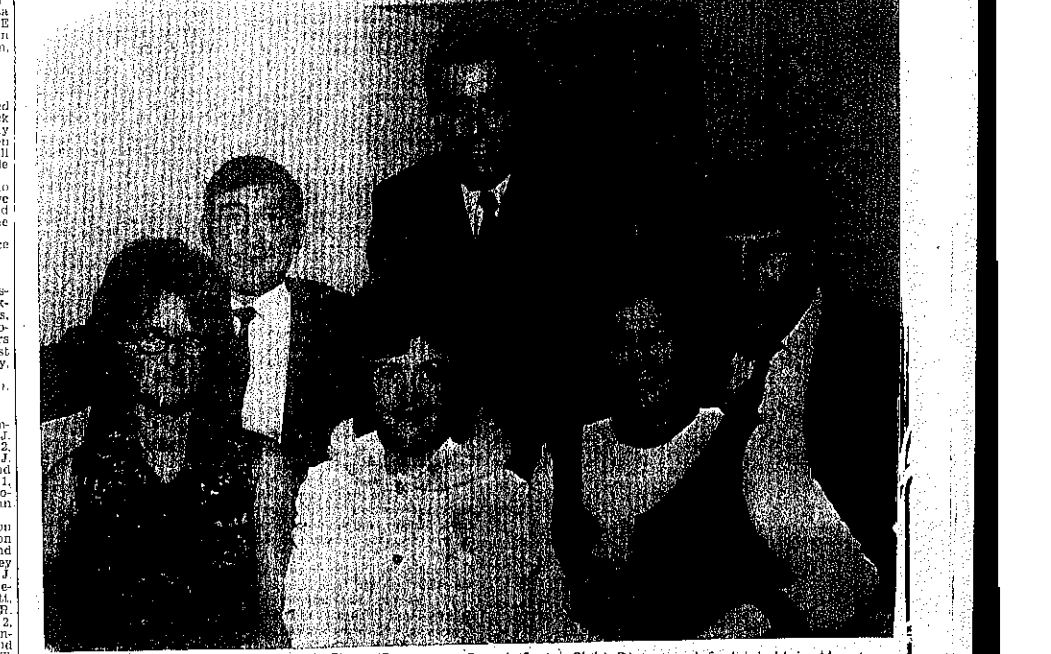
Group photographed at the Waterford Glass (Dungarvan Branch Social Club) Dinner and Social held in Montraea Hotel, Yougal, recently.