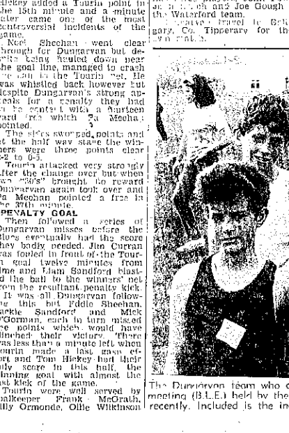
The Dungarvan team who competed in the under 13 Cross Country race...