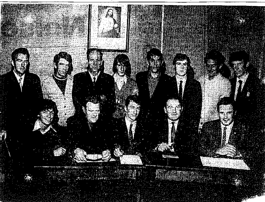
Officers and Committee of Dungarvan Athletic Club (B.L.E.) photographed at the Annual General Meeting...