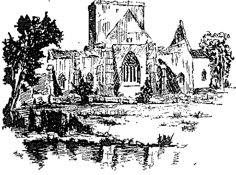
HOLY CROSS ABBEY, a supreme example of 12th, 13th and 15th century building, was founded by the Cistercians in 1180, and endowed by Donagh Carragh O'Brien, King of Limerick, in 1182.