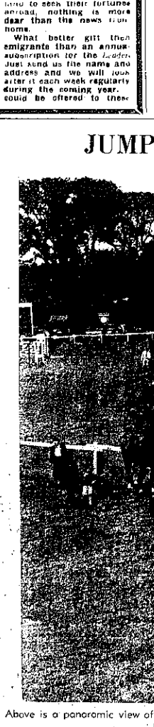
Above is a panoramic view of the jumping arena at Dungarvan Show where the major activity of the show will take place this (Thursday) afternoon.