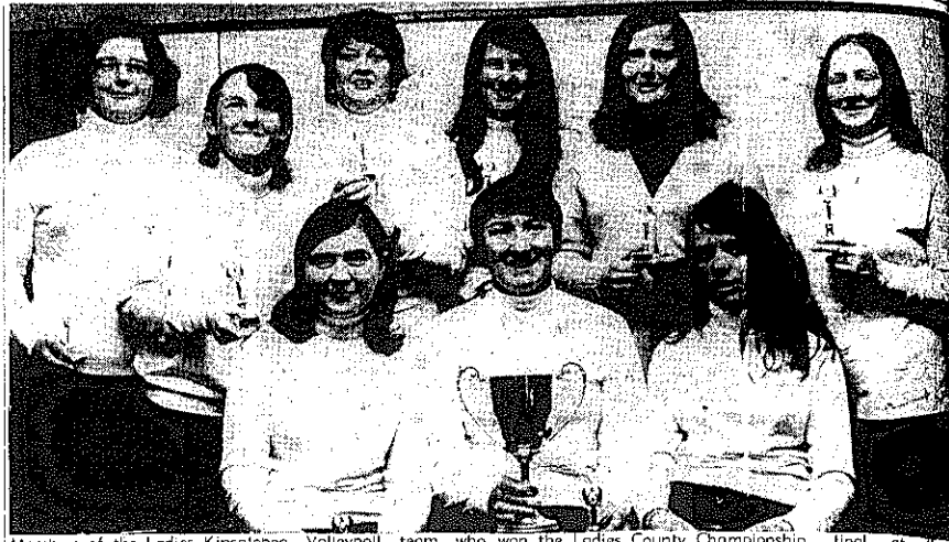
Members of the Ladies Kinsalebeg Volleyball team who won the Ladies County Championship final at the Boothouse, Cappoquin, recently.

IRISH HOSPITALS' SWEEPSTAKES, BALLSBRIDGE, DUBLIN 4 TICKETS 4 EACH CLOSING JUNE 1 BRANCH SWEEP OFFICES: COBK, SLIGO, GALWAY AND 9-11 GRAFTON ST., DUBLIN 2