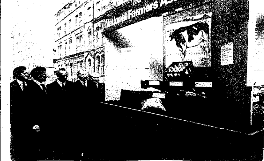
Farmers want fair prices, is outside Mr. Colley's office and the message being amplified out these days by the National Farmers' Association for the Minister for Finance Mr. George Colley.

The main purpose of today's display and parade is to highlight the rising expenses and static income