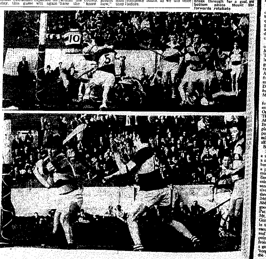
ACTION PHOTOS OF LAST SUNDAY'S SENIOR HURLING FINAL. On top - Abbeyside break through for goal, bottom photo Mount 890 forwards retaliates