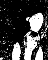
"The American Riding Machine"—teaching the locals how to ride a circus horse. This novel and original item has been so popular over the years that Duffy's Circus again included it in this year's Star-Studded Circus which visited a number of towns in Co. Waterford during the past week.