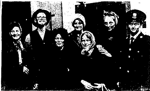
Clonbeg I.C.A. Guild who were runners-up with their production of "The Pawn Broker" in the recent I.C.A. Federation Competition for 1st prize