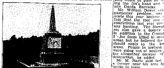
Master McGrath Monument at Colligan.