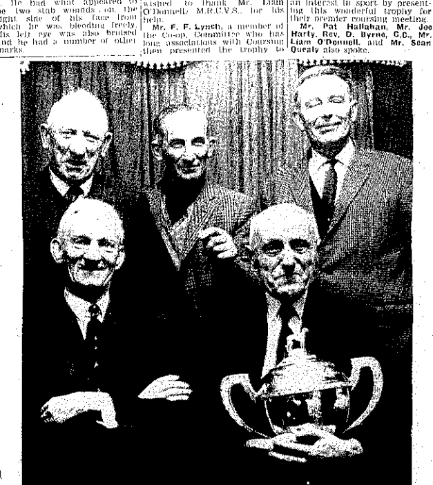
Dunganarvan Co-operative Society members presenting the trophy for the Deise Cup meeting.

Available in 56 lb. and 28 lb. bags at any of our Branches 'PHONE DUNGARVAN 3 FOR FURTHER INFORMATION