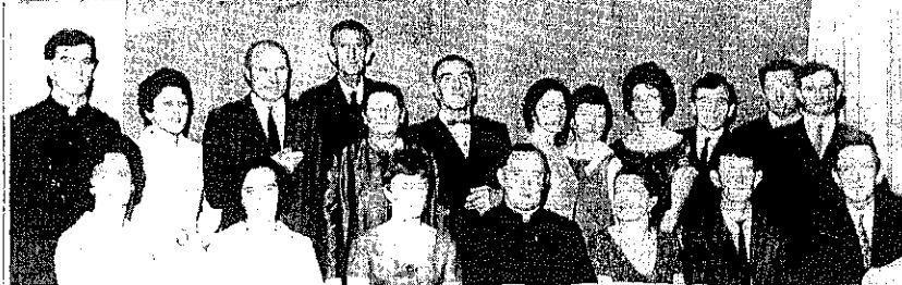
Dungarvan Macra Club members at a recent meeting.