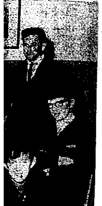
Picture shows the new Chairmen of the Club (centre) with officials and members after the G.M.

DR VALUE MONEY SAVING OFFERS. 1.3. save 3d. now 1/- Save now 6 1/2. 8 oz. Royal Baking Powder available at our fantastic Cream Crackers and Creamy Marmalade 4.3. save 6d. now 4.8. Baby Soft Toilet Paper Orange Divided Tea at 1/3.6. save 1.8. now 6 for 1.10. 7/5. Economy Tea at large selection of cut price - Big Reductions. 8.6 to 13/6. Large Selection of Fish, Fish Fingers, Vegetables, etc. and Kippered Herrings. Best Quality. Keenest.