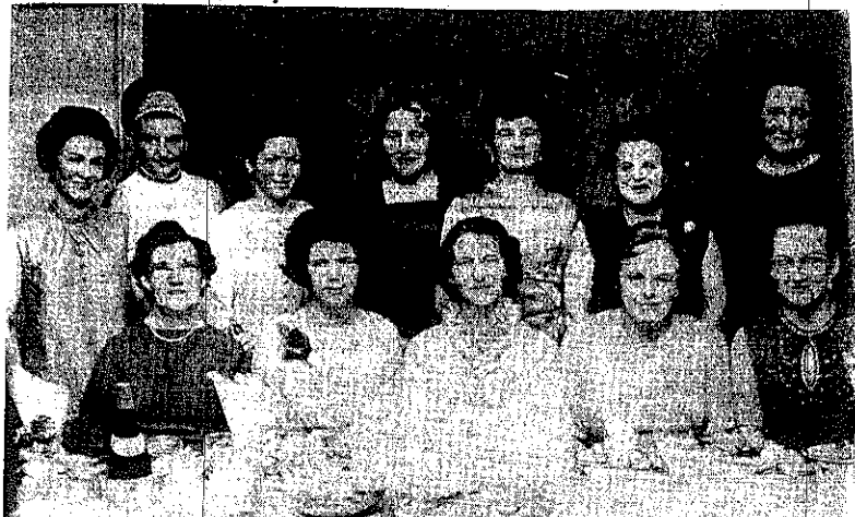
Officers and members of the Ballyduff (Upper) I.C.A. Guild who held their annual dinner dance at Lawlor's Hotel, Dungarvan, recently.