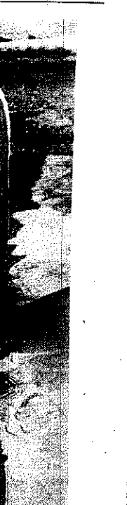
...sense too... can