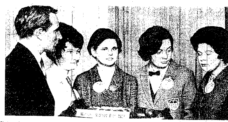
Photographed in the Intercontinental Hotel, Dublin, on Wednesday, 26th April, 1967, were the four finalists of the National Seafood Cook 1967 Competition...