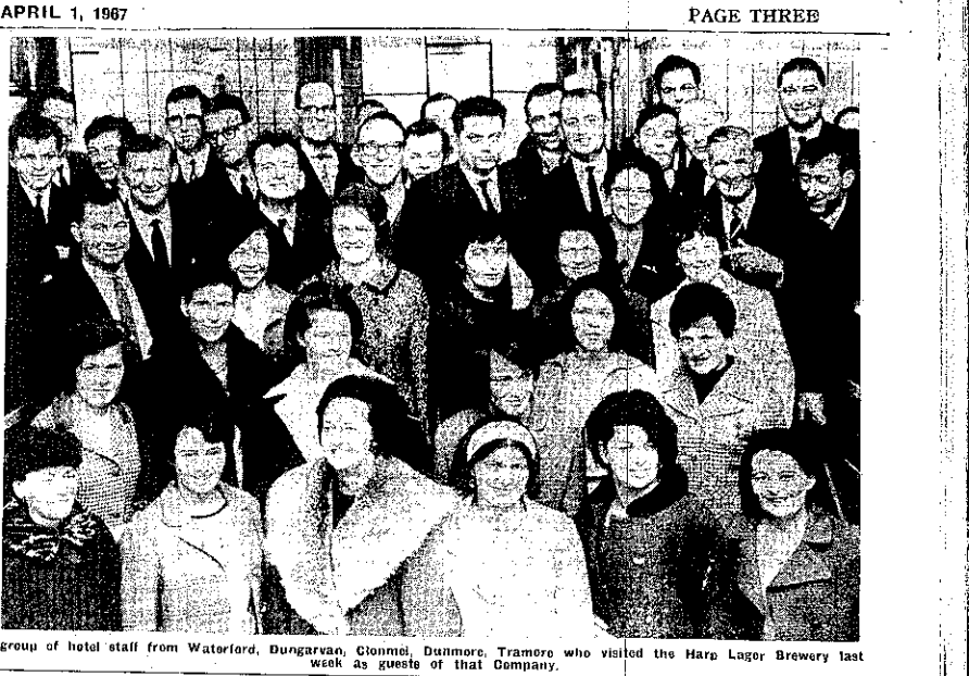
A group of hotel staff from Waterford, Dungarvan, Glenties, Dunmore, Tramore who visited the Haro Lager Brewery last week as guests of that Company.